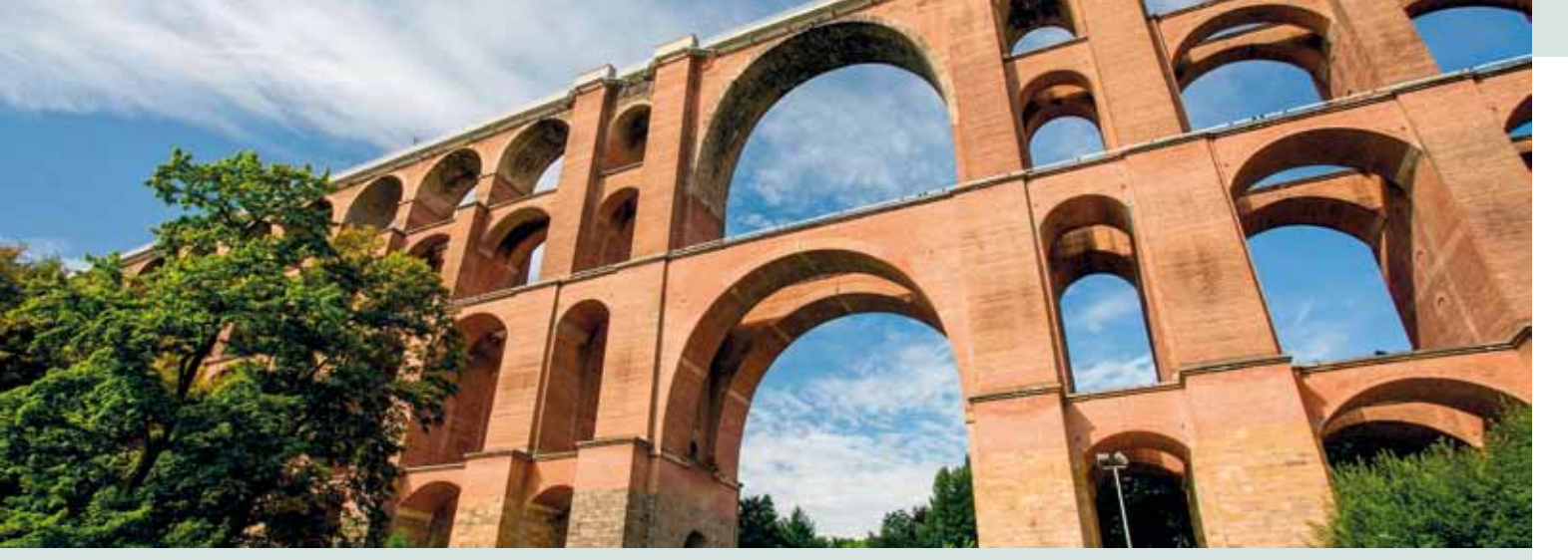
Welcome to Saxony – the land of steam railways!

Saxony, land of the steam railways in Germany's south east, is rich in tradition and home to many unique historico-technical treasures. The Saxonia, the first steam locomotive built in Germany, drove along the first German long-distance track between Leipzig and Dresden, which opened in 1839. Today, the replica of the locomotive, which is true to the original, can be viewed in Dresden's Transport Museum. In 1837, "Königin Maria" (Queen Mary) was the first German steamboat to be launched in Dresden. This was the birth of what is today the largest and oldest paddle steamer fleet in the world, and which still sails down the Elbe River daily. In western Saxony, the world's largest brick bridge can be found. Built in 1851 and taking five years of construction to complete, the monumental Göltzschtal Bridge is the landmark of the Vogtland. The state's outstanding milestones in the history of transport are thanks to Johann Andreas Schubert, a brilliant engineer, entrepreneur, professor and later director of the technical school in Dresden. Starting in 1881, Saxony began connecting the towns off the main corridor onto the more than 500 km-long narrow-gauge rail